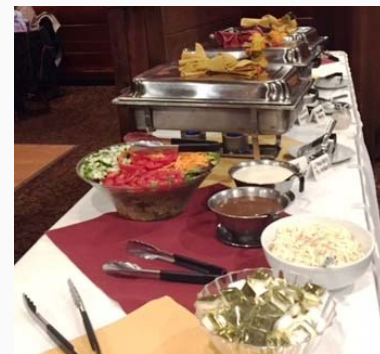
... but Collegian Court does put on a nice buffet.

TUESDAY, 02/13/2018 ~ Join us at Collegian Court ~ 89 Park St., Chicopee, MA 01013