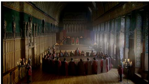
Okay, so our round table won't be quite like this....

We will summarize the panel-discussion and issue notes to all attendees.